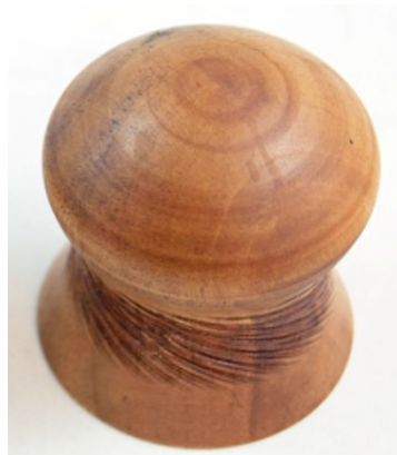
Don Prorak - Cherry