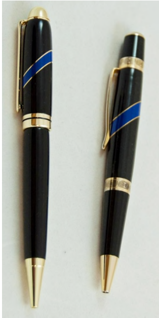
Ryan Custer - Acrylic