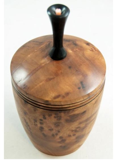
Les Stern - Camphor