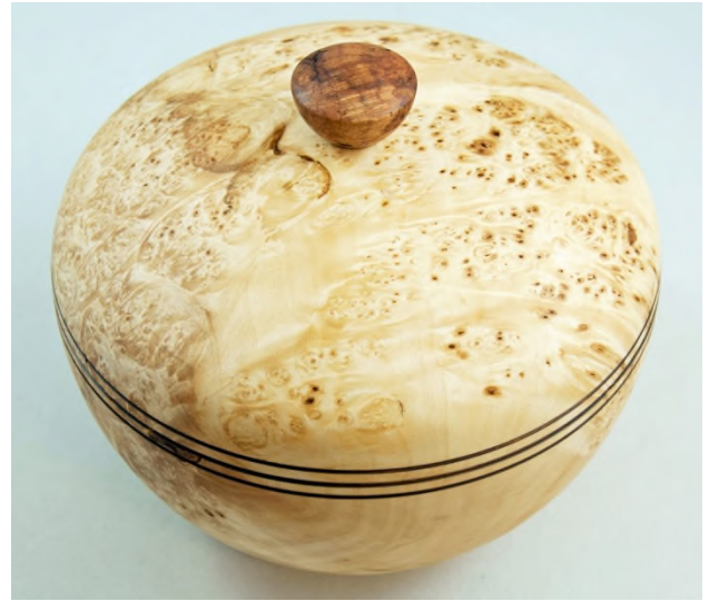
Les Stern – Box Elder Turning Challenge Advanced Winner