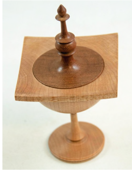
Phil Houck - Maple