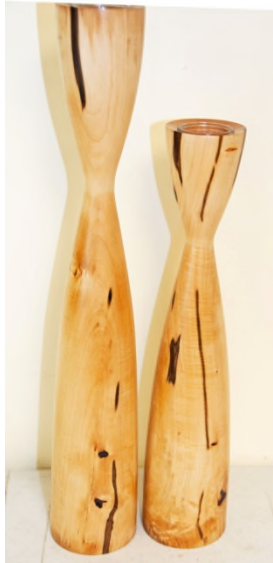
Roper - Linden