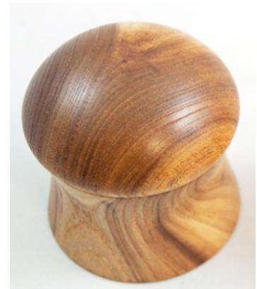
Don Prorak - Elm