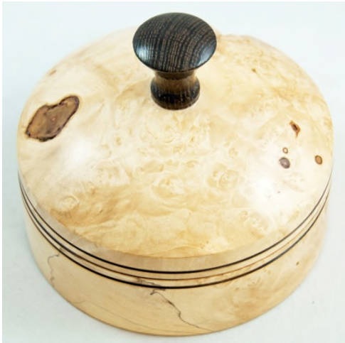
Les Stern – Box Elder