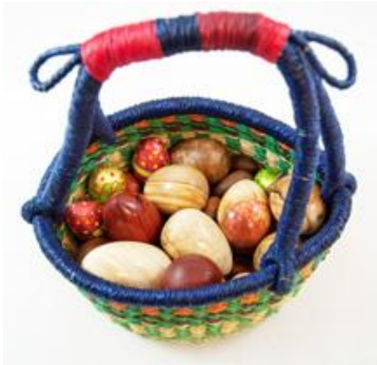
Roper – various woods