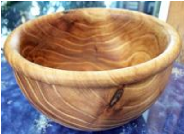
Don Prorak - Elm