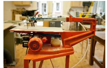
Hegner Scroll Saw $750