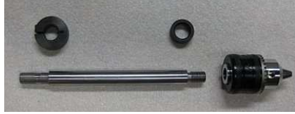
Two stop collars, drill chuck, and cold rolled steel rod threaded at end.