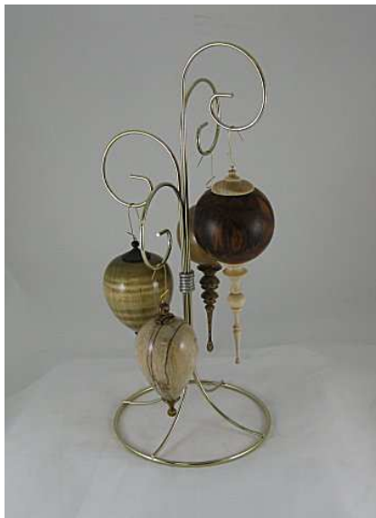
Curt Vogt – Four Ornaments.