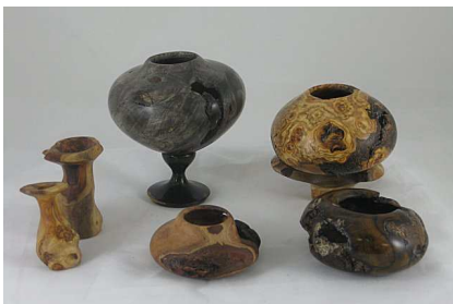
Les Stern – Hollow Forms, three smallest out of Aspen, L to R for the rest are Buckeye Burl/Blackwood stand, Box Elder Burl (?) and Desert Ironwood.