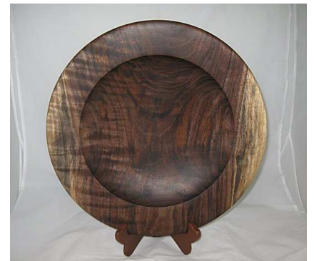
Tom Wirsing – 14”D Claro Walnut Dish w/Walnut Oil finish.