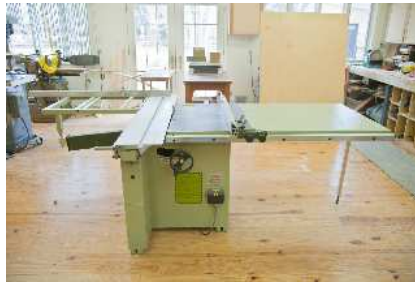
MiniMax-SC3-10 Sliding Table Saw $2500