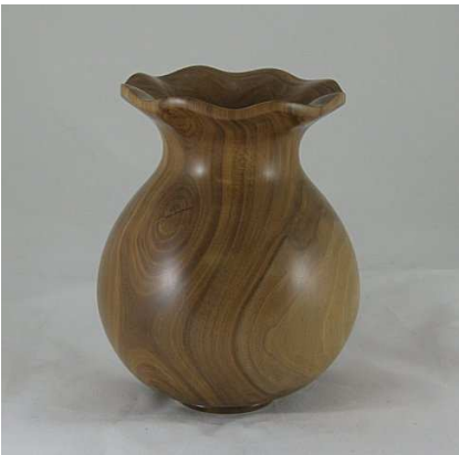
Phil Houck – Crab Apple and Fruit Apple Hollow Forms w/Armour Seal and Minwax Paste wax finish.