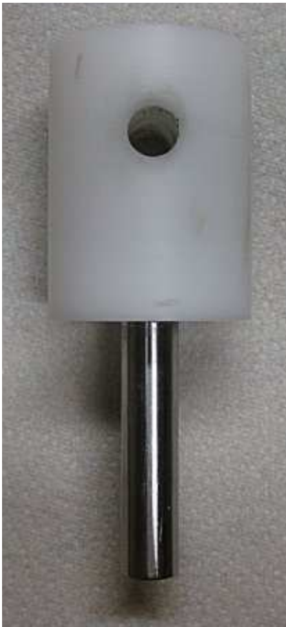
Turned plastic w/hole drilled to receive rod that goes into lathe banjo and hole drilled at 90° to accept shaft.

Need a drill guide to make precise holes in a turning? Set it to the right height and location. Use your index to make holes at precise increments at your choice. This design uses a 3/8" chuck, self lubricating hard plastic, cold rolled steel rods – 3/8" (or diameter to fit intended chuck) and rod diameter that fits your lathe banjo, one or two stop collars. Pictured in this section is the drill guide made by Ron Howard to fit his lathe. Use these pictures for the idea and adapt the sizes that make it suitable for your lathe.