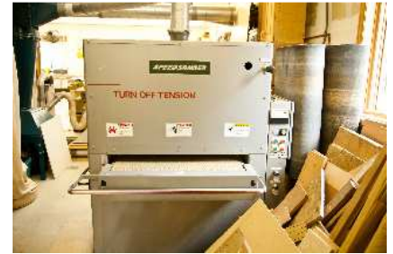
AEM-37 Wide Belt Sander 10hp, 3ph, 230V $3500