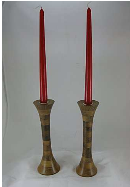
Jerry Smith – Danish Modern Design Segmented Candlesticks (design can also be used as a bud vase) Teak Wood w/Lacquer Base Sanding Sealer and Clear Paste Wax finish. 9 3/4”H x 3 1/4”D.