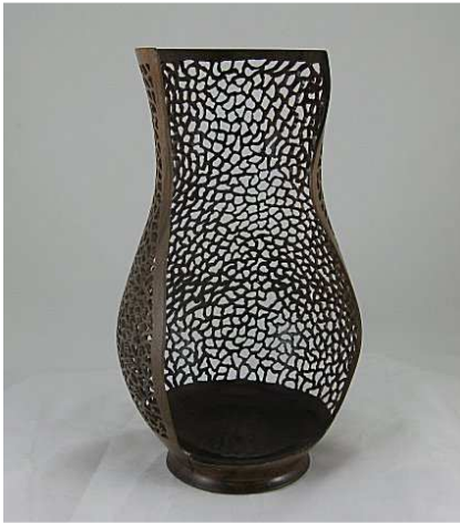
Terence Rice – Walnut and (mostly) Air Vase w/Lacquer finish. 5”D x 8”H. “A disaster is just a design opportunity”. I’ll say!