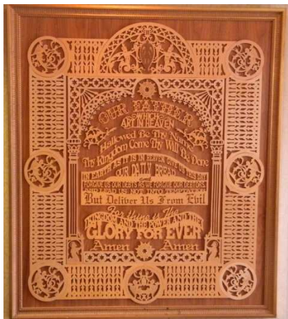
Scroll work anyone? Here's tons of it!