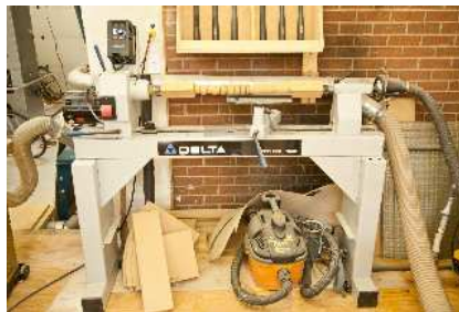
Delta 16" Wood Lathe $1250