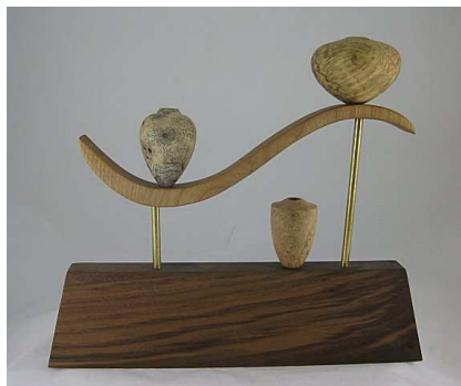
Roper – “The Three Wisemen” out of Buckeye Burl, Maple Burl, Box Elder Burl, Walnut, and Beech w/Wipe On Poly finish.