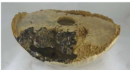
Grove Brown – Natural Edge Hollow Form out of Box Elder w/Spray Lacquer finish.