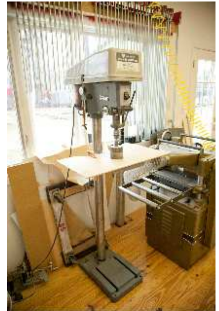
Delta -15" Floor Drill Press $350