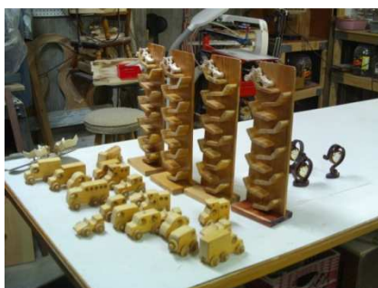
Some of the toys that Dutch makes.