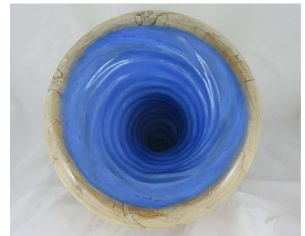
Paul Stafford – Whirlpool Bowl out of Maple w/Crystalac finish.