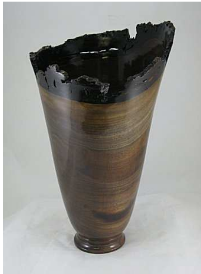
Dave Yeoman – Natural Edge Walnut Vase w/Tung Oil finish.