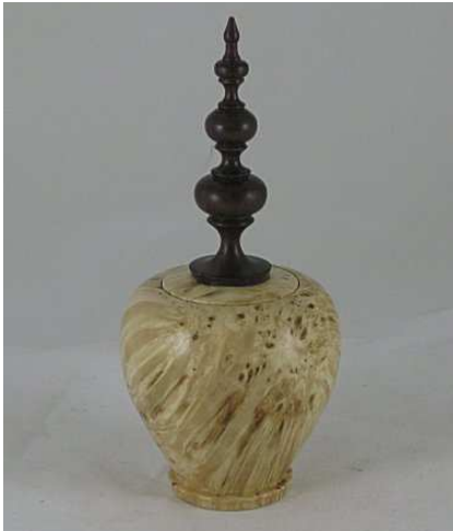
Grove Brown – Box Elder Hollow Form with Walnut Finial. Triple E and Shelia Wax finish.