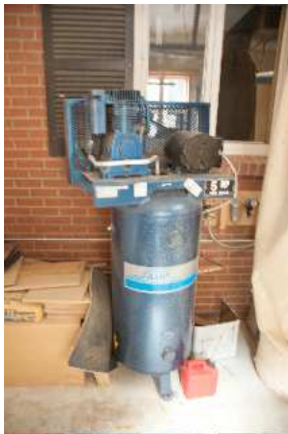
Two-Stage, 5hp Compressor $500