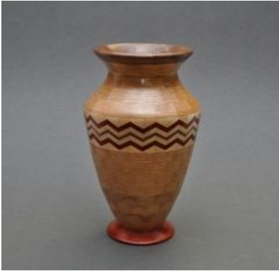
Ken Miller – Segmented hollow form in red oak, walnut and padouk.