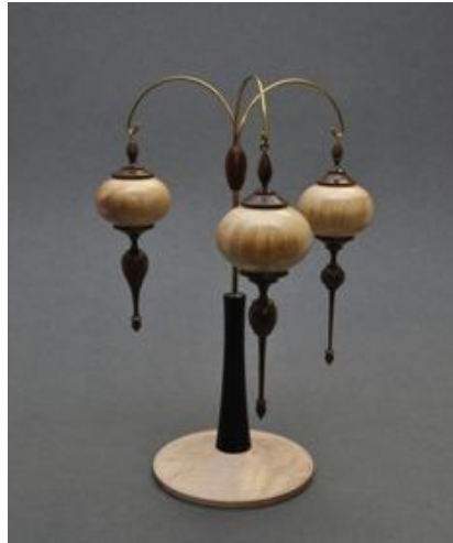
Pete Holtus – Assortment of Christmas ornaments in aspen and walnut. ❖