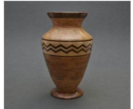
Ken Miller – Segmented hollow form in red oak, walnut and maple.