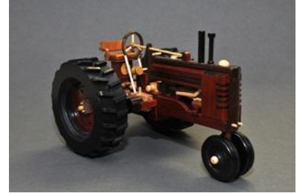
Rick Orr – Tractor in bloodwood and other woods.