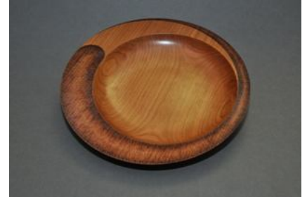
Unknown - Platter