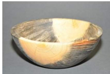
Steve Claycomb – Bowl in beetle killed pine.