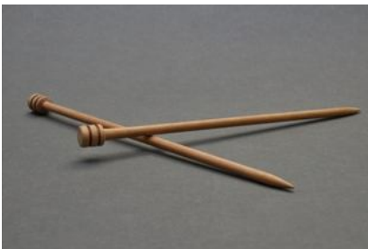
Doug Clark – Knitting needles in mahogany.