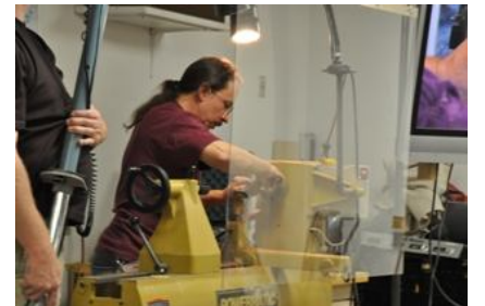
He sands ornament carefully since the ornament has some corners.