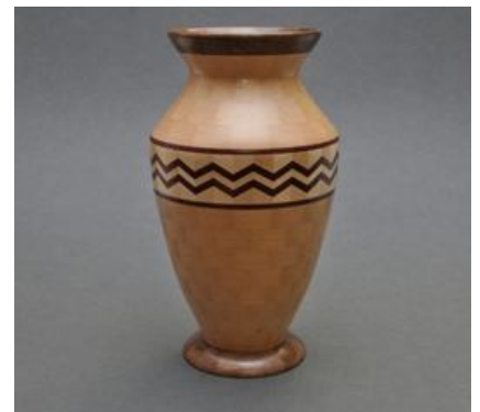
Ken Miller – Segmented hollow form in beech, walnut, and purpleheart.