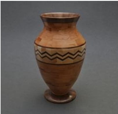
Ken Miller – Segmented hollow form in cherry, walnut, and maple.