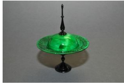
Ron Ainge – Lidded finial box in dyed maple.

The turning challenge for September was crochet needles. Unfortunately no one entered the challenge.