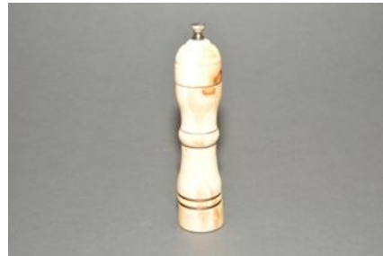
Peter Young – Pepper grinder in apple.