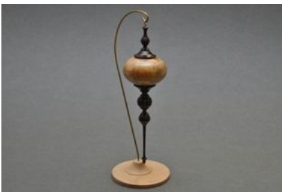
Pete Holtus – Christmas ornament in aspen and walnut.