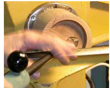
Hollowing the end grain.