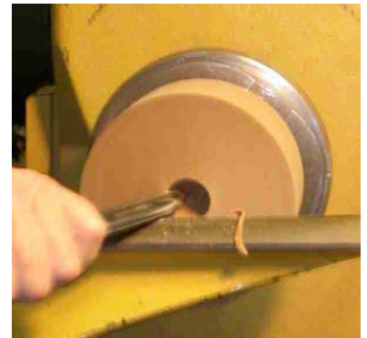
Notice how he moves from the center to the outside rim, to follow the grain.