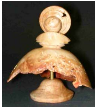
Earl Waibel – Eccentrically turned angle with holey ("holy") halo of burl.