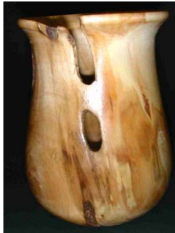
Clark – Vase of aspen.