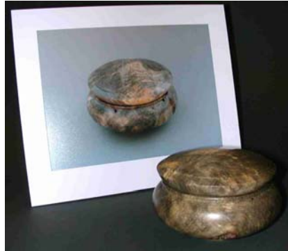
Pete Holtus – Lidded box of buckeye burl with photo. Winner of Turning Challenge.