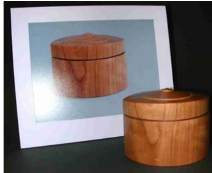
Pete Holtus – Oval lidded box with photo.