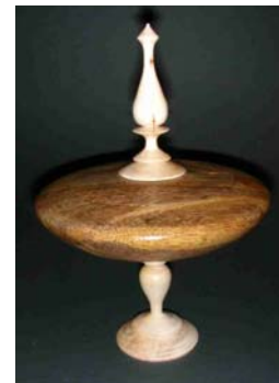
Les Hess – Lidded form of mango and aspen.