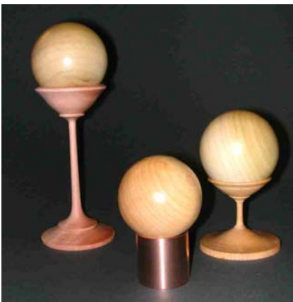
Pete Holtus – Turned hollow balls on stands.