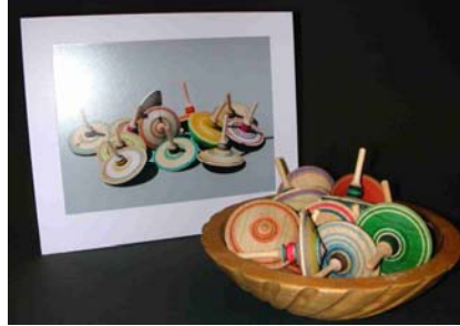
Pete Holtus – Bowl of tops with photo.