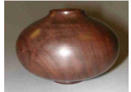
Bruce Perry – Small hollow form of walnut.