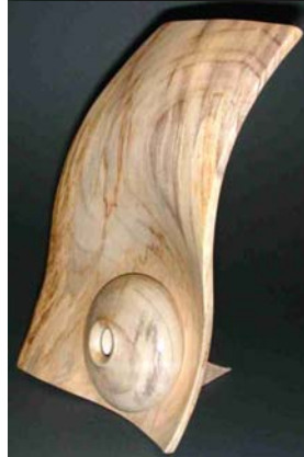
Bruce Perry – Top and side view of his signature winged hollow form.