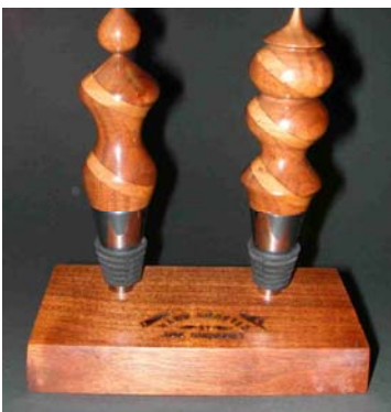
Beautiful set of laminated wine stoppers.