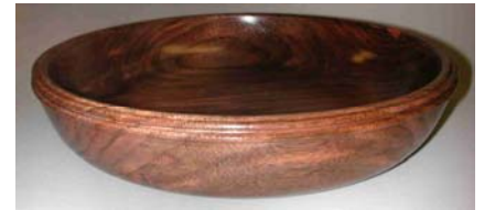
Jill Rice – Bowl with beaded edge of walnut.