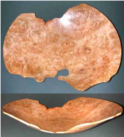
Steve DeJong – Top and side views of natural-edged bowl made of maple burl.