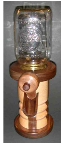
Norm Hadeen – Candy dispenser of maple, walnut, and glass.