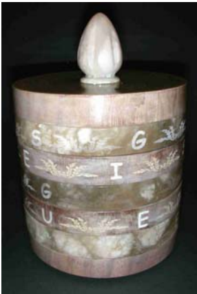
Paul Stafford – Puzzle box of walnut and alabaster. To open, you must spell the right word.