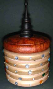
Paul Stafford – Puzzle box of ebony, walnut, maple and glass. To open, you have to line up the gems of the proper color.