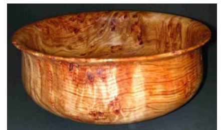
Curl Vogt – Bowl of poplar burl.

The turning challenge for the September meeting was Photos with Woodturning.