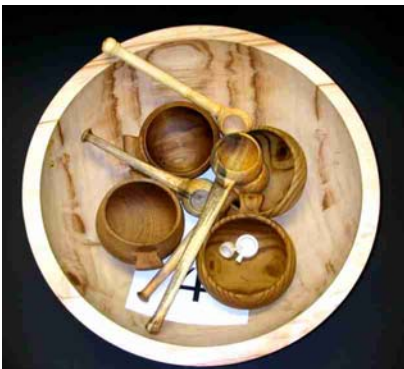
Bruce Perry – Bowl with various treen, including miniature winged