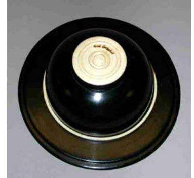
Wide-rimmed of ebony and holly. Top and bottom view. Beautiful contrast to previous piece.