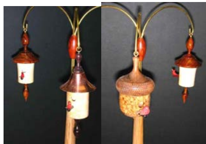
Pete Holtus – Birdhouse ornaments of burl, maple, spun copper, cocobolo, with knurled detail.