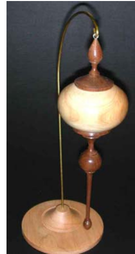
Pete Holtus – Ornament with eccentric base. ❖