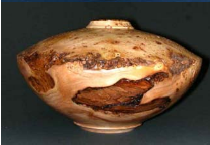
Grove Brown – Hollow form in maple burl. Top and side view. Winner of the turning challenge.