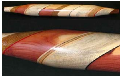
Nate Frohman – French rolling pin of laminated wood.