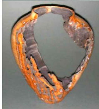
Jeff Barenberg – “Pushing the Limit Too Far” hollow form of wormy maple. (Yes, that’s background you see through it.) Top and side view. Winner of the turning challenge.