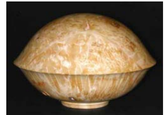
Pete Holtus – “Trick” closed space form with nickel inside of maple burl.