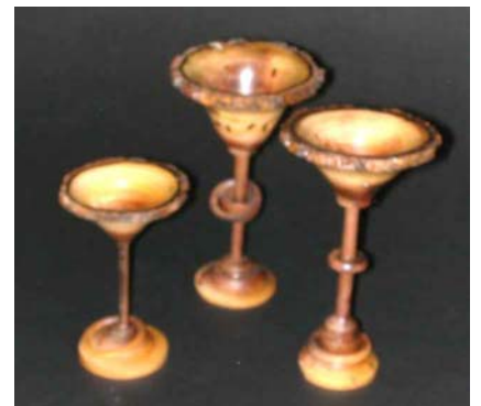
Steve Claycomb – Natural-edged goblets with captured rings of walnut.