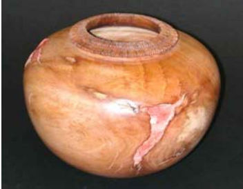
Paul Stafford – “Fixer-Upper” hollow form with trompe l’oeil carving of bricks.