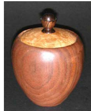
Rolta Lowery - Lidded box of walnut, burl, and ebony.