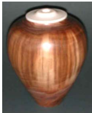
Tom Tedesco – Hollow form of walnut and Corian.