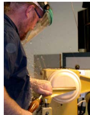
First, Bear shapes the outside, bottom and starts the wide rim.