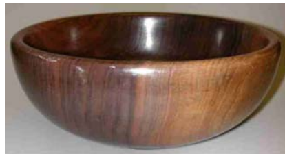
Curt Will – Bowl of walnut.