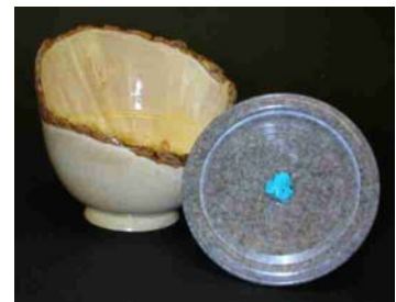
Ron Ainge – Detail of lid underside with inlaid turquoise.