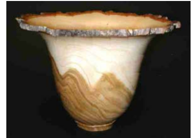
Phil Houck – Natural-edged bowl in apricot.