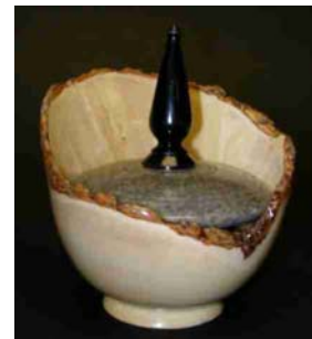
Ron Ainge – Lidded box in natural-edged box elder, Corian, and ebony.