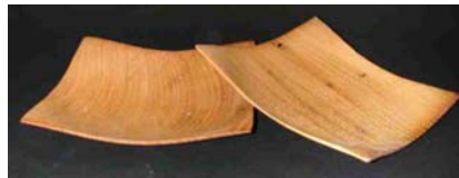
Pete Holtus – Square-edged bowls in wormy chestnut.