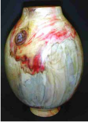
Curt Will – Hollow form of box elder.