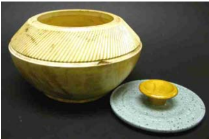
Gene Wentworth – Lidded form with carved detail of cottonwood and Corian.