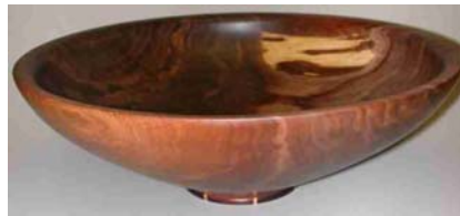
Grover Brown – Bowl of walnut.