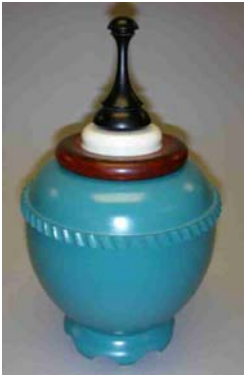
Gene Wentworth – Lidded form with carved detail in various materials.