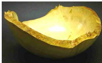
Phil Houck – Natural-edged bowl in box elder.