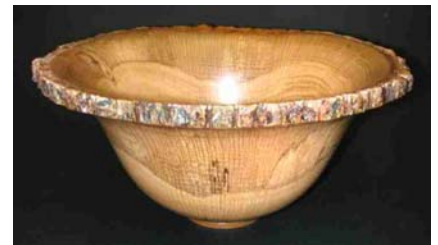
Phil Houck – Natural-edged bowl in post oak.