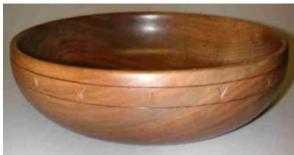
Jerry Baron – Bowl in walnut with carved detail.