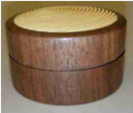
Pete Holtus – Lattice-topped box in walnut and boxwood.