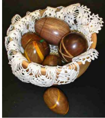
Bowl of wooden eggs.