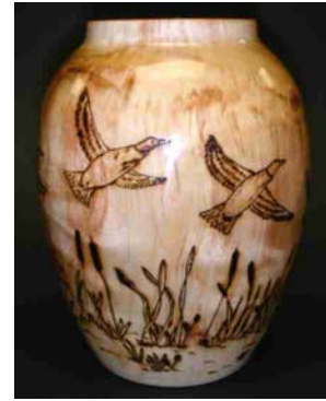
Ron and Betty Ainge – Hollow form in cottonwood with pyrography detail.