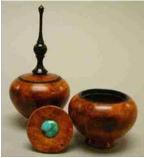
Pete Holtus – Lidded forms in burl, blackwood, and inlaid turquoise.