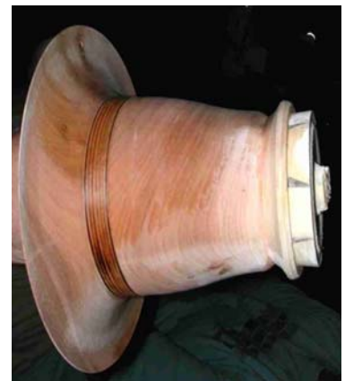
Sideview of his wooden hat.

Using light to gauge the thickness of the brim.