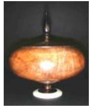
Grover Brown –Madrone burl, holly, walnut, and ebony lidded box. Winner of April challenge.