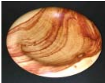
Lars Nyland – Juniper “elbow” bowl.

Bear Limvere – “Boxed” sets of candlesticks above, various woods. Triple candlestick in pinon with natural edge to the left. Tallest one measures 1.75 inches in height.