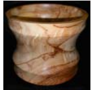
Terrence Rice – Cottonwood vase.