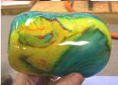
Samples of Don's work, showing some of the beautiful uses of color to enhance the grain of the wood. From his "River Rock" series, trying to copy the natural shapes of river-shaped rocks.