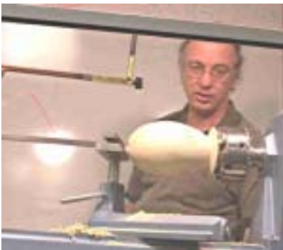
Turning the outside of the form.