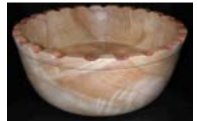
Allen Fulton – Cottonwood bowl with carved rim.