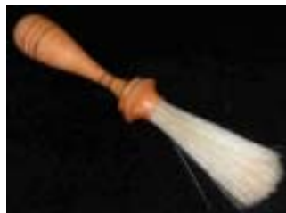
Gene Wentworth – Honey locust brush with natural bristles.