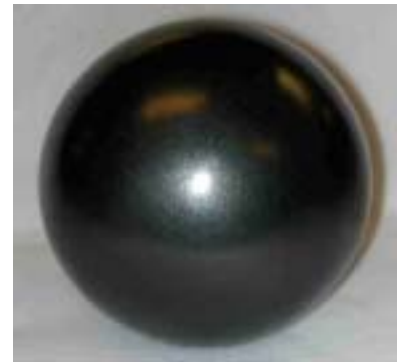
Gene Wentworth – Ebonized silver maple ball.