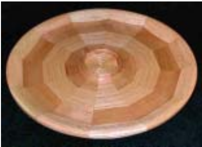
Steve Claycomb – Segmented platter in oak and cherry.