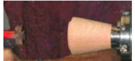
Blank mounted to turn taper and chuck tenon.