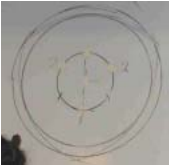
Laying out the axis points.