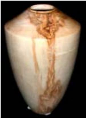
Bear Limvere – Colorado Aspen vase with brass inlay.