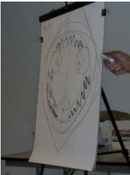
Laying it out relative the square blank.