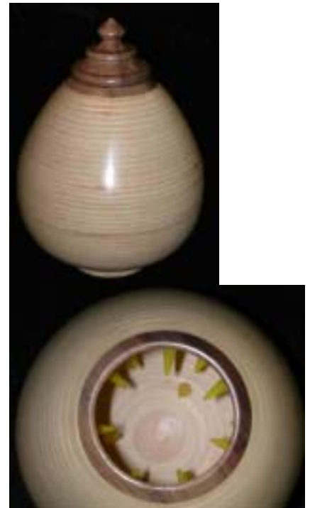
Paul Stafford – Birch plywood and walnut vase with teeth.