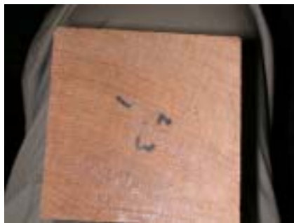
Wide end of taper