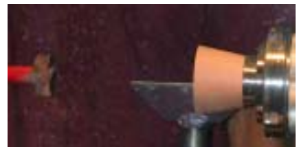
Bottom parted off and top ready to turn inside.