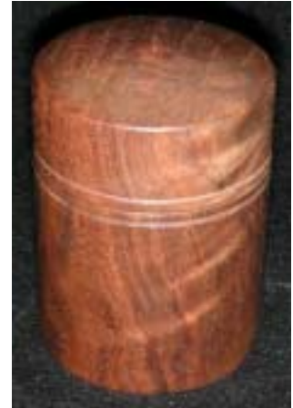
Pete Holtus – Lidded walnut box.