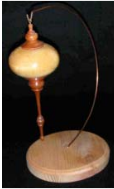
Pete Holtus – Cherry and box elder ornament and stand.