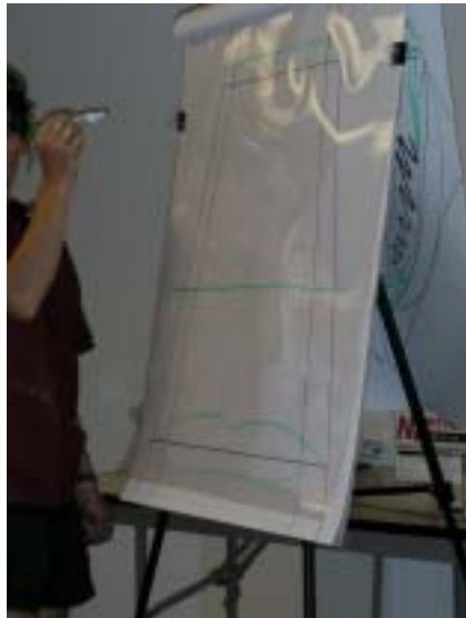
Laying out the cross-section.