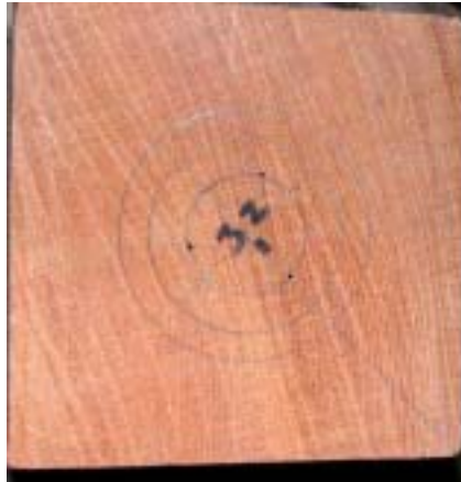
Transferring the marks to the blank. Narrow end of taper.