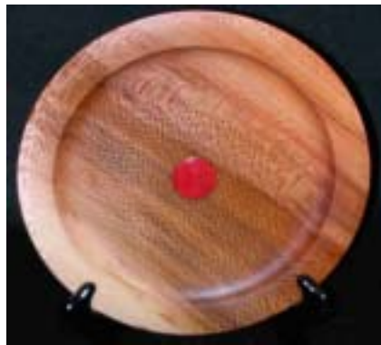
Jill Rice – Sycamore, pink ivory, and copper platter.