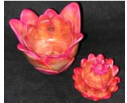
Paul Stafford – Carved and colored cedar flower box with lid-activated recording.