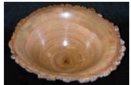
Phil Houck – Post oak natural-edged bowl. ❖