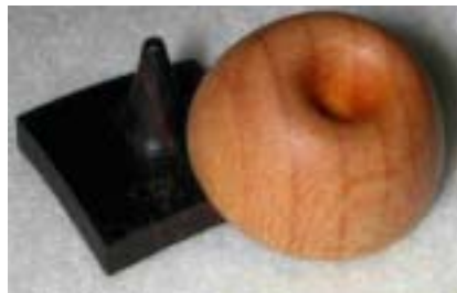
Bear Limvere – Miniature "vortex" bowl and stand (1" diam.).