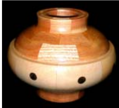
Steve Claycomb – Segmented vase in oak, maple, and walnut.