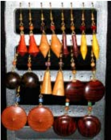
Bear Limvere – Earrings in misc. woods.