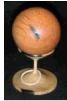
Pete Holtus – Seamless oak sphere rattle on boxwood pedestal.