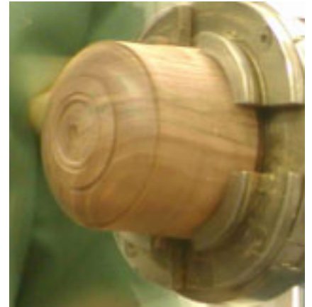
Close-up of the outside of the form. Note the turned tenon so the blank can be reversed in the chuck and hollowed.