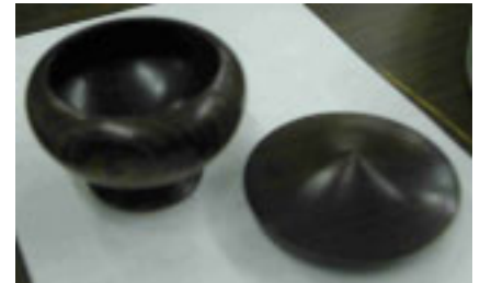
Pete Holtus – Miniature cocobolo box.

Here are some more of the beautiful items that members have brought.