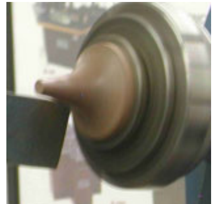
Close-up of the inside piece.