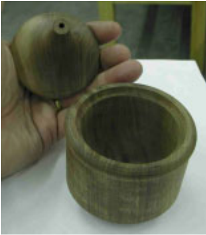
The two finished pieces. ❖