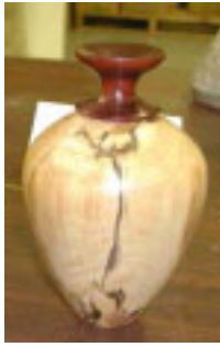
Ron Bentall – Birch vase with rosewood rim.