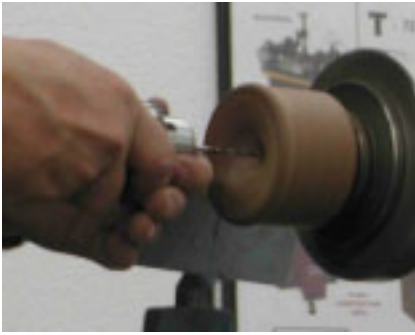
Drilling out the shaker hole.