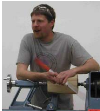
Trent telling it like it is.