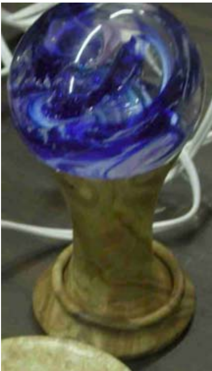
Les Stern – Lighted glass globe stand in aspen.