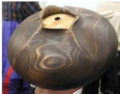
Sample of a vessel of illusion.

Trent Bosch demonstrated his “Bowls of Illusion” (also called “nested vessels”). His vessels look like nesting bowls, with the inner vessel of one type of wood, and the outer, carved vessel of a different type of wood. Check out Trent’s Web site at www.trentbosch.com .