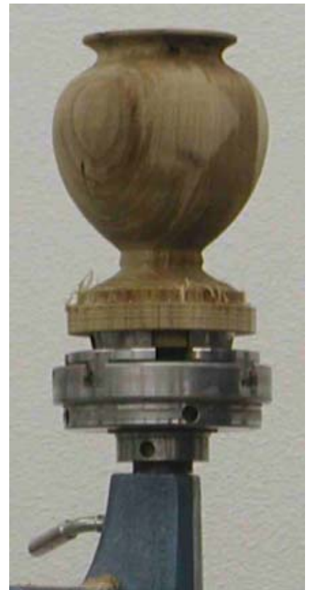
Trent likes to carve his bowls while still mounted in the chuck.