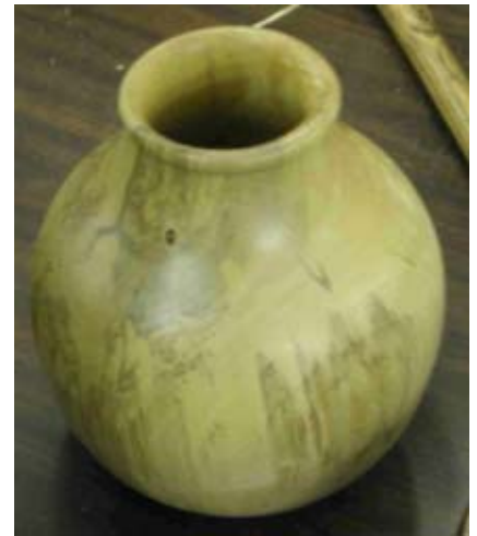
Jill Rice – Aspen vase.