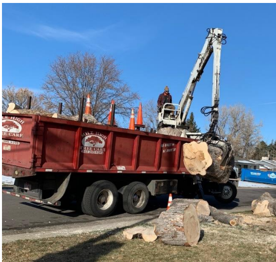
It is silver maple, and it was a couple of blocks from my house. The guy from Mile