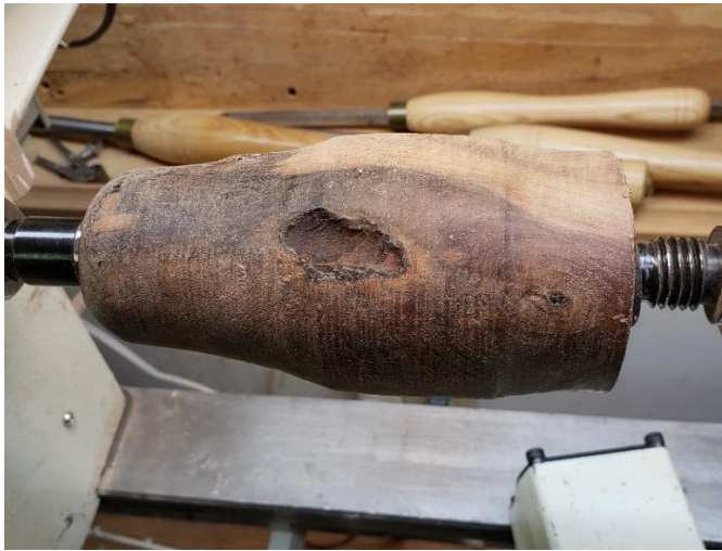
Small walnut box. Before and after. – Kim Komitor