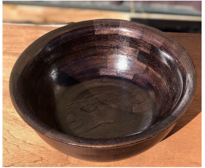
Here is an assortment of bowls completed over the last few weeks. – Larry Hughes