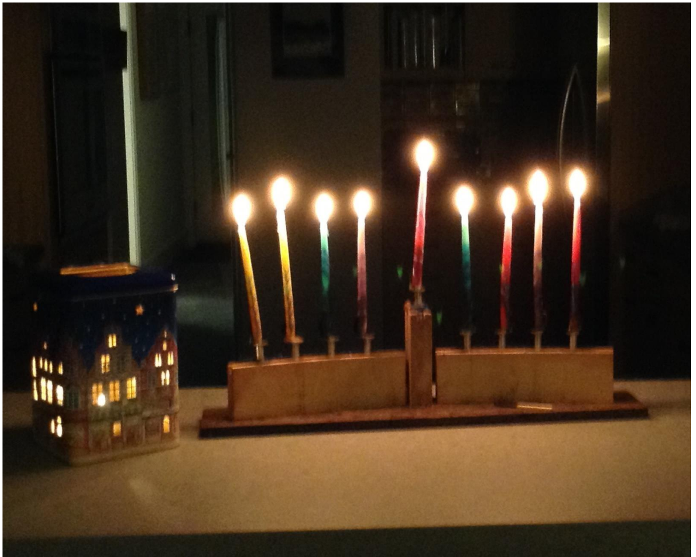
A menorah made with leftover furniture parts. Hanukkah starts December 10 at sundown. – Merryl Saylan