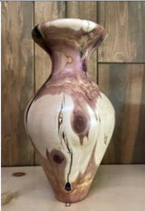
A vase I just finished. It is Juniper and about 13 inches tall. Finish with Myland friction polish. – Jeff Turner