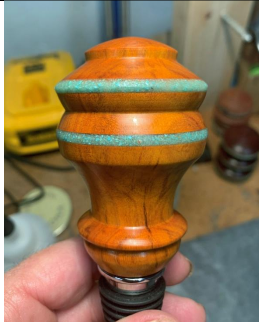
(Nice turquoise inlays Jan!)