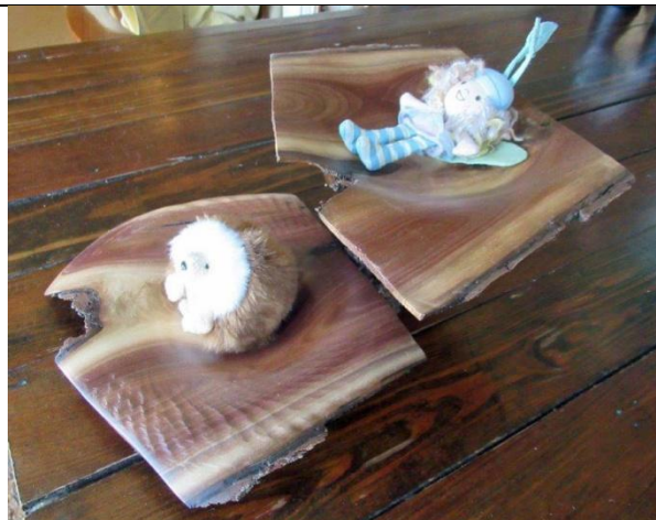
Two winged bowls I did out of the same walnut crouch. - Dale Quakenbush