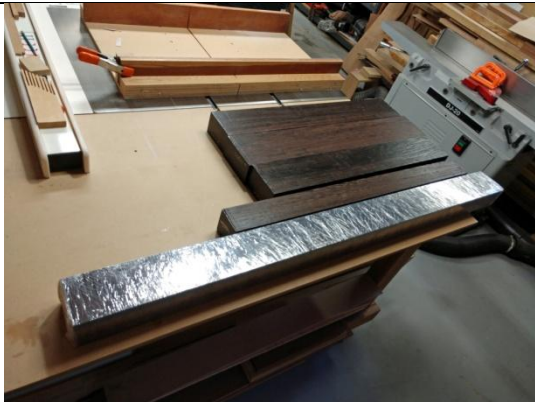
African Wenge all set for some table legs. Al Murphy