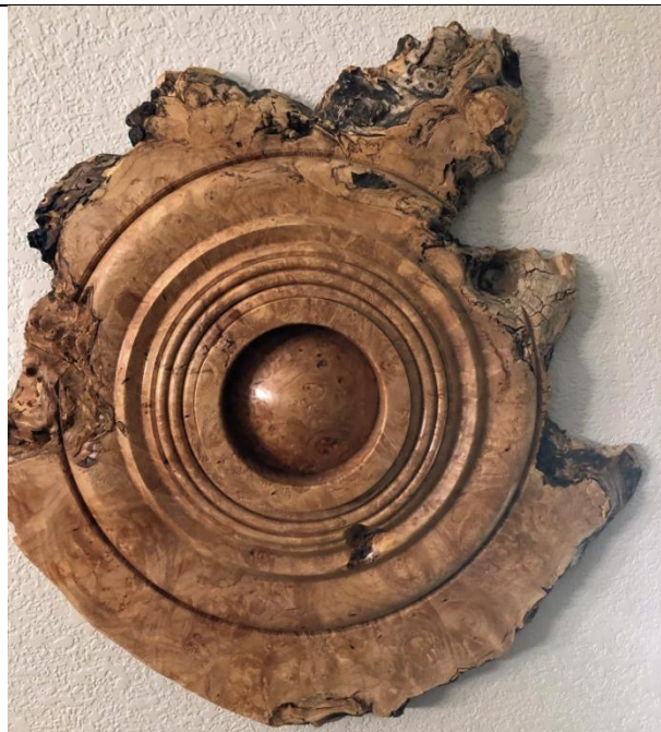
Big Leaf maple burl wall hanging about 22"