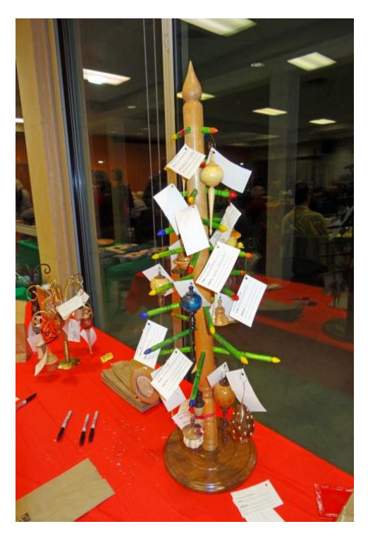
Many brought their special ornaments to exchange.