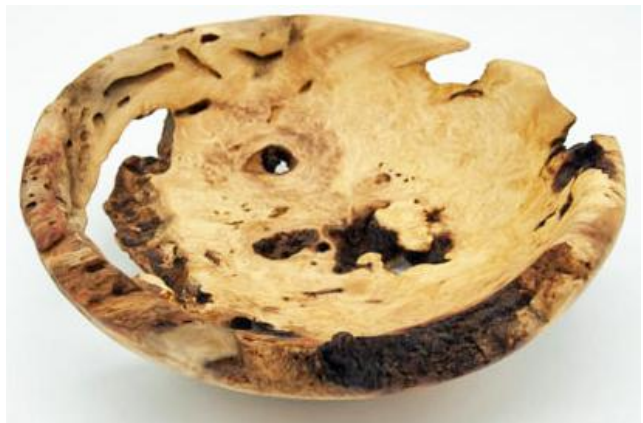
Les Stern – Box Elder Burl