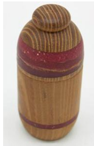
Tim Capraro – Osage Orange