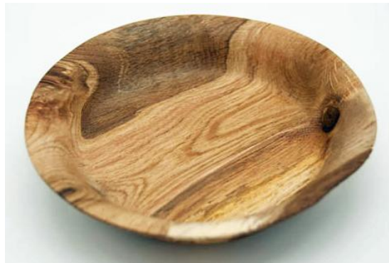
Dale Quakenbush - Oak