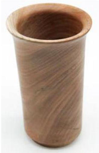
Dale Quakenbush - Cherry