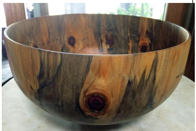
Don Prorak – Norfolk Island Pine