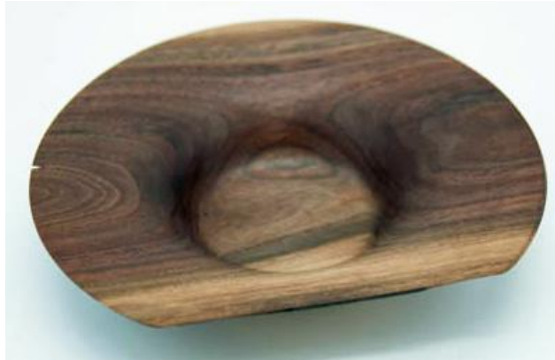
Dale Quakenbush - Walnut