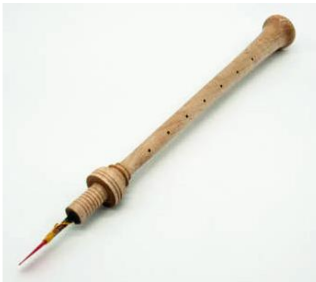
Tim Capraro – Figured Maple