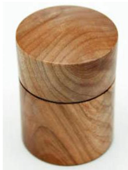
Ryan Custer – Curly Maple