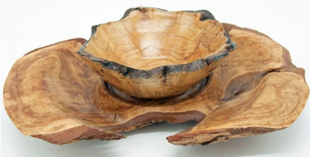
Suzanne Thompson - Wood