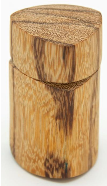
Tim Capraro - Marbledwood