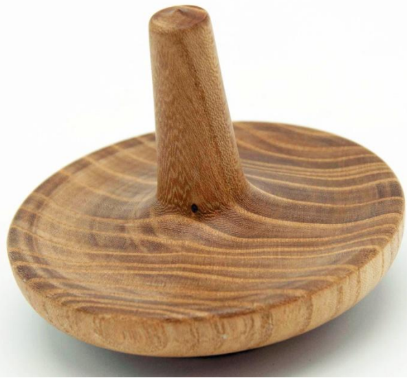
Leanne Stember - Elm