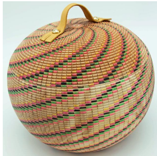
Gene Wentworth - Wood