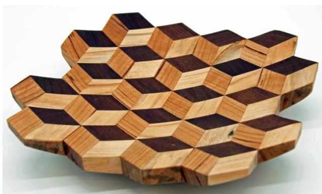
Evan Hoing – Cherry, Walnut, Maple