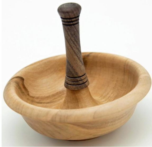
Leanne Stember - Maple