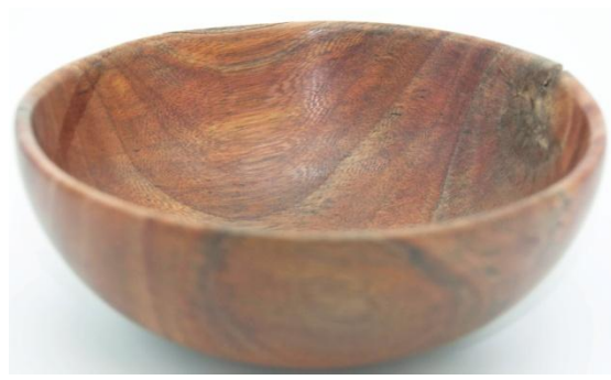
Les Stern - Wood from Ghana