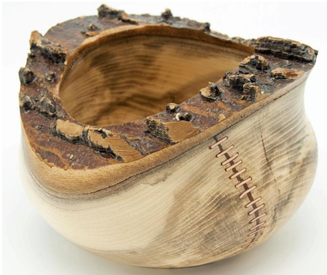
Dale Quakenbush – Hackberry, Copper Staples