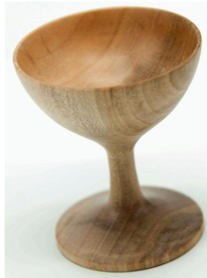
Dale Quakenbush - Maple