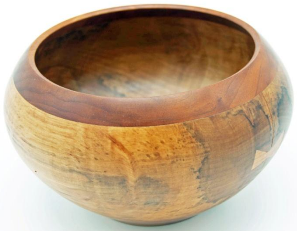
Ken Rollins – Apple, Cherry