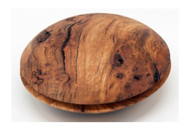
Les Stern - Cherry Burl