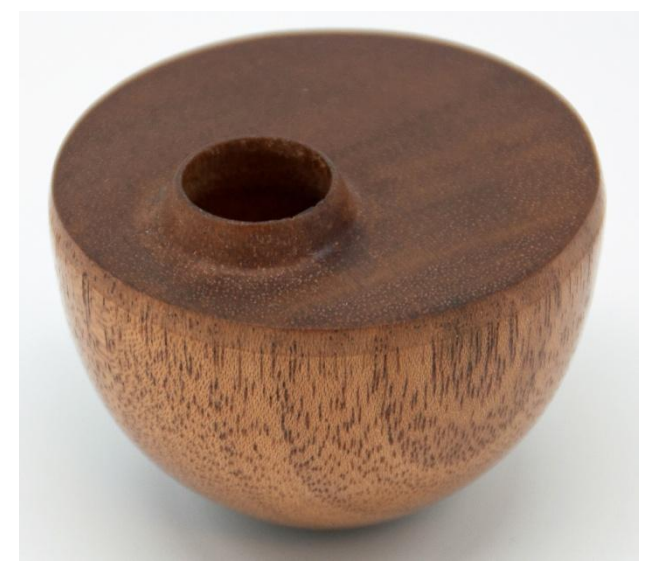
Tim Capraro - Mahogany