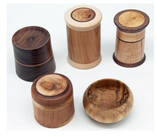
Larry Abrams – various woods