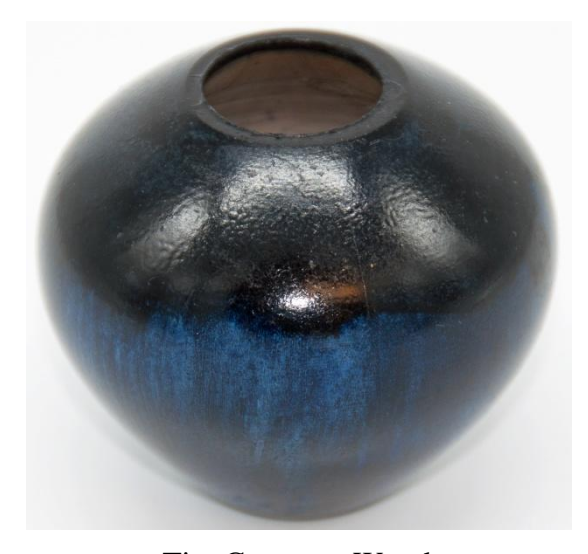
Tim Capraro - Wood