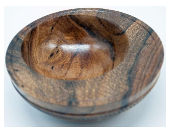
Don\ Prorak-English\ Walnut