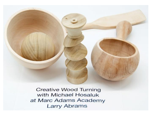
Larry Abrams – various woods