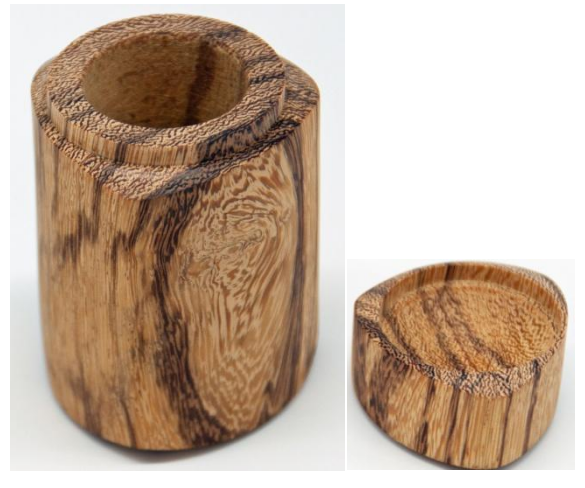
Tim Capraro - Marblewood