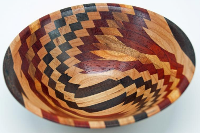
Evan Hoing – Various Woods