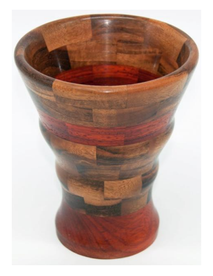
Tim Capraro - Padauk