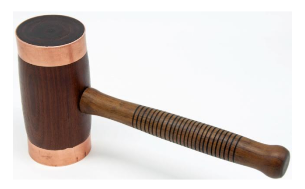
Les Stern – Ipe, Copper