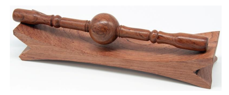
Tim Capraro - Bubinga