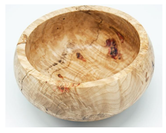
Evan Hoing – Box Elder Burl