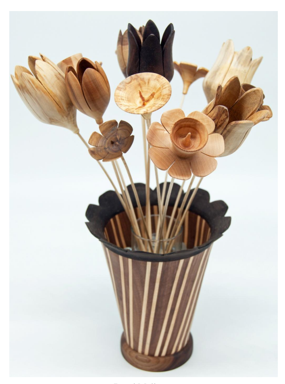
Buryl Mellema Various Woods