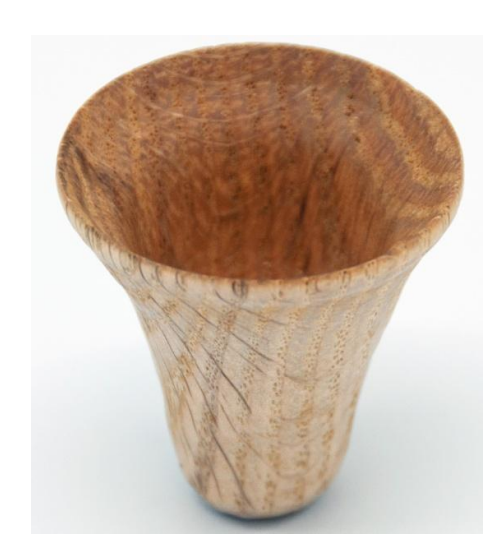
Tim Capraro – Red Oak