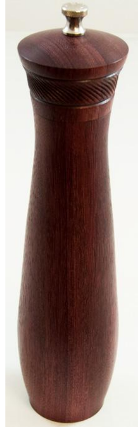
Don Prorak - Purpleheart