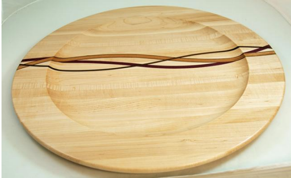
Roger Holmes – Maple, Walnut, Cherry, Purpleheart