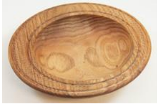
Don Prorak - Butternut