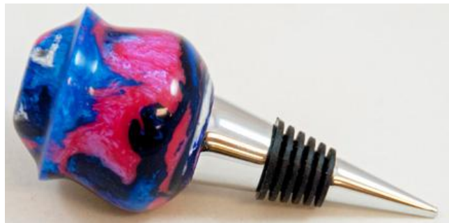
Leanne Stembler - Alumilite