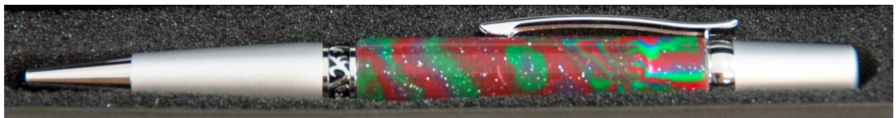
Ed Cypher – Polymer Clay