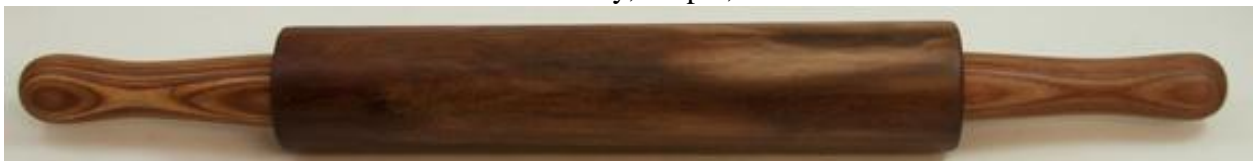
Steve Claycomb – Walnut, Plywood