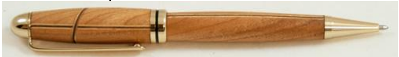
Rick Cantwell – Cherry, Maple, Walnut veneer