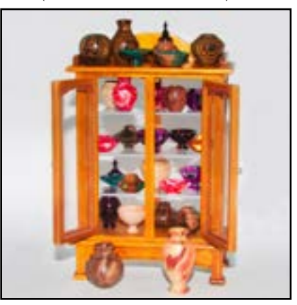
Scott Schlapkohl made this unique 4" x 6" piece from locust and finished it with a combination of tung oil and wax.

is filled with his miniatures. The whole thing is just under 6" tall. Also shown are a series of miniature Cocobolo plates, platters and bowls. For scale, you can see the dime in the foreground.