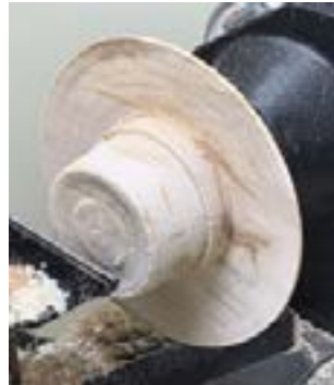
Shaping the hat