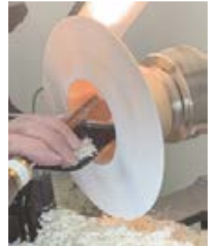
Thin enough to see light