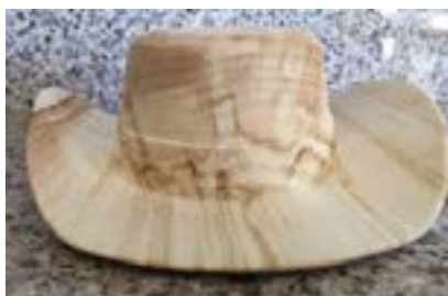
Dry, bands removed & sanded