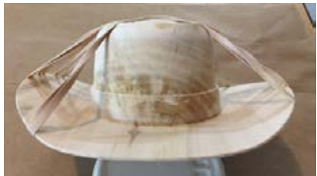
Bending the rim with rubber bands